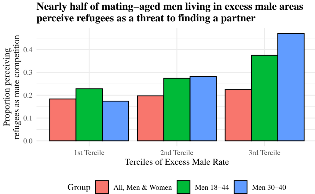
Figure 1: Proportion of respondents who see refugees as a mating threat by age group and tercile